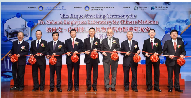
▲ 諾貝爾獎得主埃爾文·內爾博士（左六）生物物理與中醫藥研究室揭牌 Nobel Laureate Dr. Erwin Neher (left 6th) set up Biophysics Laboratory of Chinese Medicine at M.U.S.T.

學院也是我國迄今唯一依託於國家重點實驗室這一國家級平台開辦中醫藥高等教育課程的學府。經國家科技部批准，中藥質量研究國家重點實驗室（澳門科技大學）於2011年1月25日正式掛牌成立，這是我國在中醫藥領域設立的首家國家重點實驗室。重點實驗室從國際知名大學引進了優秀的研究團隊和學術人員，配備了一大批先進的分析儀器和生物活性檢測設備，其中用於中藥化學分析的各種色譜-質譜聯用儀有近30台，包括世界最新的表面飛行時間二次質譜儀與LC-SPE-NMR色譜-質譜-核磁共振聯用儀，均用於最前沿的中藥質量、創新藥物及生物醫學研究，這也為學院的教學和實驗提供了一大批優秀師資力量和專業設備。此外，重點實驗室建立了諾獎獲得者工作站：