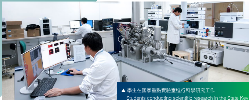
▲ 學生在國家重點實驗室進行科學研究工作 Students conducting scientific research in the State Key Laboratory of Quality Research in Chinese Medicines

學院擁有一支年齡與知識結構合理的優秀師資隊伍，他（她）們具有在中國內地知名中醫藥學府或歐美國家世界知名學府的學習或工作經驗，科研成果豐碩，在 Nature、Science 等國際知名學術期刊上發表了高水平的學術論文。他（她）們既具有豐富的中醫藥教學和研究經驗，又具有國際視野和經驗，通曉中英雙語，能為學生提供良好的授課和研習訓練。目前，學院共有教師 59 名，教研隊伍包括講座教授 2 名，教授 4 名，特聘教授 14 名，副教授 19 名，助理教授等 20 名。學院根據各個課程的需要，安排優質師資進行專業授課及指導畢業論文研究工作，包括中藥學博士學位課程的全英文授課及論文撰寫等。