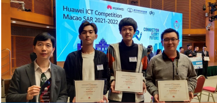
▲ MUST won the 2 nd Prize in the Huawei ICT Competition Asia Pacific on Network Track and represented Macau in the Global Final 澳門科技大學的隊伍獲得網絡賽道亞區亞軍，並代表澳門晉級全球總決賽

Development Fund, the National Natural Science Foundation of China, the Macao Higher Education Fund, and so forth. In the latest release of "Essential Science Indicators (ESI)" in July, 2021, by Clarivate Analytics (former Thomson Reuters), it is revealed that the Computer Science field of M.U.S.T. has for the first time joined the rank of the top 1% among universities and research institutes across the world in the relevant area. Our research accomplishments have made significant contributions to this designation. To further accelerate the research momentum, the School applied and was granted over 7 million MOP by the Macao Science and Technology Development Fund and the Macao Higher Education Bureau in 2019 to establish Macao's first NVIDIA's GPU cluster server.