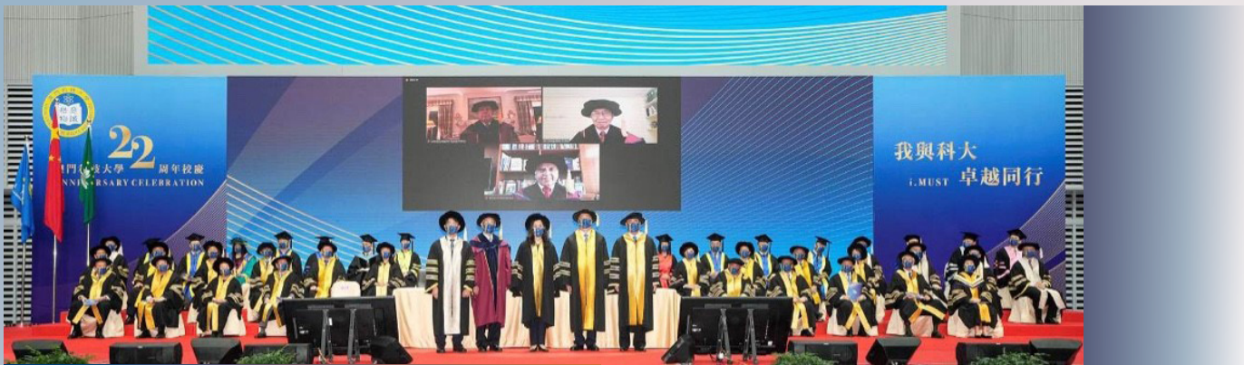
▲ Macau University of Science and Technology held a 22 nd Anniversary Ceremony for the Conferment of Honorary Doctoral Degrees cum Ceremony for Inauguration of the Faculty of Innovation Engineering 澳門科技大學 22 周年校慶榮譽博士學位頒授典禮暨創新工程學院成立儀式

澳門科技大學的五年策略規劃（2021- 2025 年）為大學的發展目標和重點發展方向制定了宏偉的藍圖。在重點發展方向中特別提出進一步加強工程學科建設以及鞏固優勢學科發展。我們生活在一個創新和技術高速發展的時代。在如此充滿挑戰的年代，為了成功培養未來的科技人才和領導者，重新調整學術和教育的目標，鞏固多學科、跨學科研發和教育的基石，已經成為全球教育工作者達成的共識。為適應時代的發展和社會的需求，大學 創新工程學院 (FIE) 由此而生。