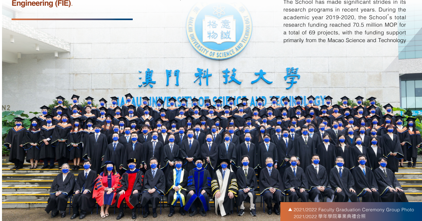
▲ 2021/2022 Faculty Graduation Ceremony Group Photo 2021/2022 學年學院畢業典禮合照

The School has made significant strides in its research programs in recent years. During the academic year 2019-2020, the School's total research funding reached 70.5 million MOP for a total of 69 projects, with the funding support primarily from the Macao Science and Technology