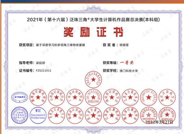
▼ A Student from the School of Computer Science and Engineering won the first prize in the 2021 Pan-Pearl River Delta+ University Student Computer Competition 計算機科學與工程學院學生榮獲 2021 泛珠三角+大學生計算機作品賽一等獎

The Department of Environmental Science and Engineering is one of the four school/ departments in the Faculty of Innovation Engineering. Environmental Science and Engineering is an important academic platform for the professional program in engineering education and research, which may lead to further