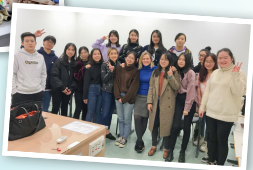
▶ 國際學院學生到西班牙卡斯提亞 - 拉曼查大學交流 Spanish major students participated in the study abroad program in The University of Castilla-La Mancha, Spain