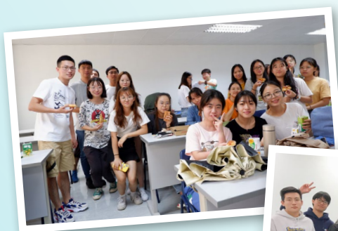
◀ 交換生迎新會 Incoming students orientation

UIC will host the 29th Annual Conference of the International Association of Chinese Linguistics (IACL-29) in late May 2023. Taking this opportunity, UIC will continue to face new challenges, embark on new journey for achieving the next milestone.